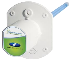
16" UVC 24V In-Duct w/ Safety Disconnect