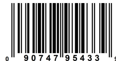
20x25 Custom Color Right Angle Air Cleaner w/5in Media MERV11