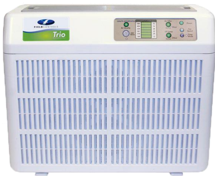
Trio Portable 3in1 Purification System 120v